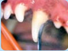
Removing the calculus using an ultrasonic scaler, followed by polishing the teeth is a very effective form of treatment

A healthy mouth typically has bright white teeth and shrimp pink (or sometimes pigmented) gums. However plaque bacteria are constantly accumulating on the surface of their teeth and will, in time, lead to inflammation of the gums – a condition called gingivitis . Affected gums are more reddened in appearance, and these changes may also be associated with localised mineralisation of the plaque to form calculus (tartar) – see picture (b).